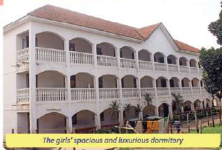
The girls' spacious and luxurious dormitory