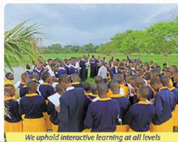
We uphold interactive learning at all levels