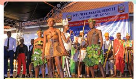
Helping every learner tap into their every potential - The St. Michael High School MDD Festival