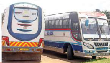
School transport available for co-curricular study