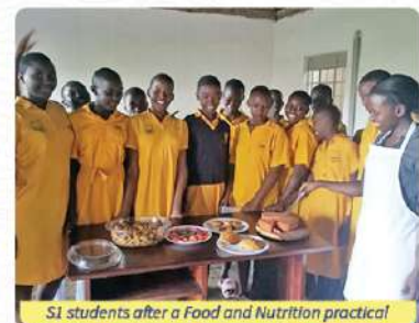
SI students after a Food and Nutrition practical