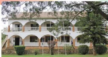
A section of the A-Level block, situated against a perfectly serene, nurturing and academic backdrop