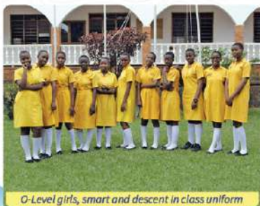
O-Level girls, smart and descent in class uniform